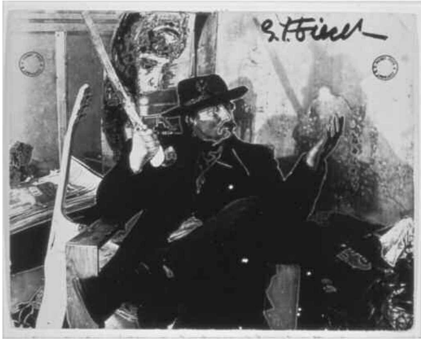
SELF-PORTRAIT , early 1960s 9½ x 11¾ in. (24.1 x 30.2 cm)