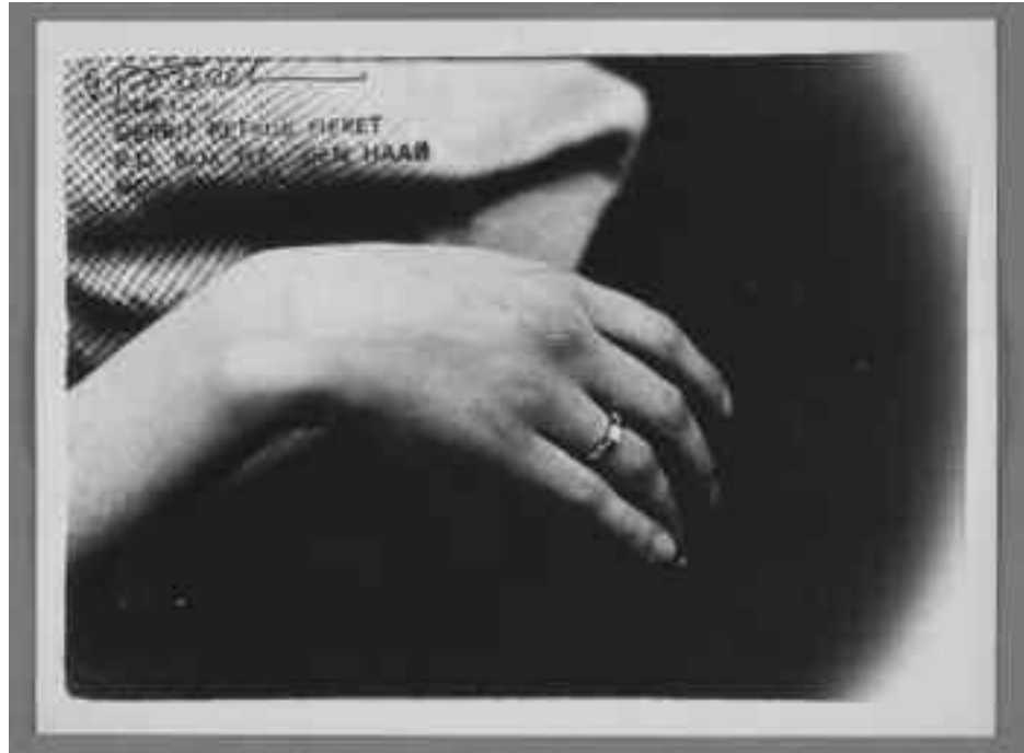
TOP UNTITLED , ca. 1960s 7 1/8 x 9 3/8 in. (17.9 x 23.8 cm) on mount 8 x 11 1/8 in. (20.3 x 29.7 cm)