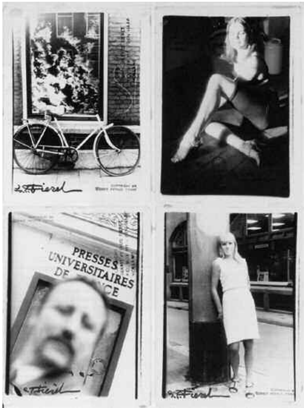
LEFT UNTITLED , ca. 1960s composite of four photographs, each 9 3/8 x 7 in. (23.8 x 17.8 cm) on mount 19 1/2 x 15 1/4 in. (49.8 x 38.7 cm)