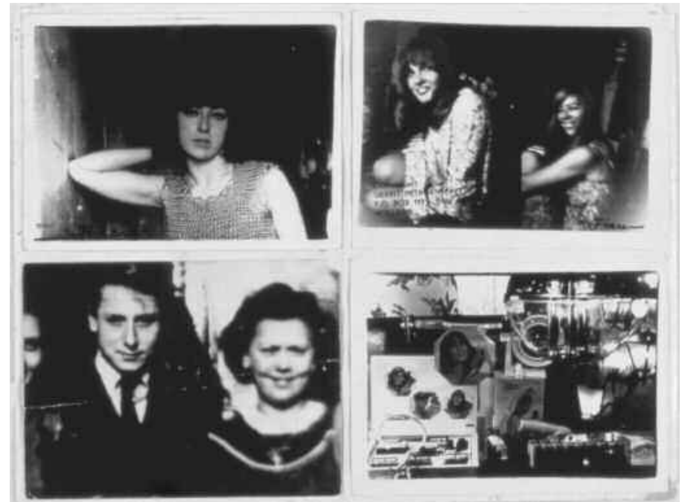
UNTITLED , ca. 1960s composite of four photographs, including one self-portrait with family, each 7 x 9 \frac{3}{8} in. (17.8 x 23.8 cm) on mount 14 \frac{1}{4} x 19 in. (36.2 x 48.3 cm)