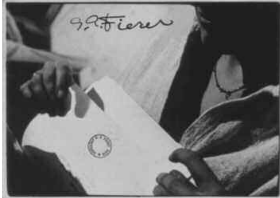
BOTTOM UNTITLED , ca. 1960s 6 1/4 x 8 3/4 in. (15.9 x 22.2 cm)