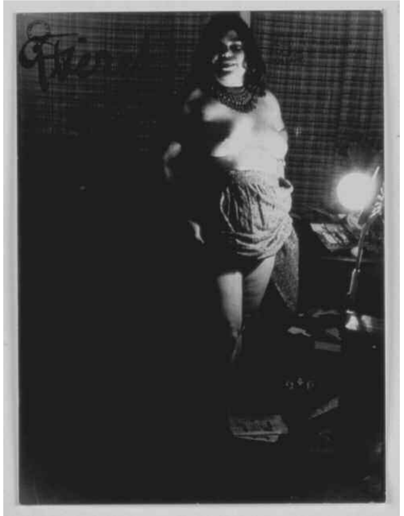
OPPOSITE UNTITLED , ca. 1960s 15 3 / 4 x 11 3 / 4 in. (40 x 29.8 cm)