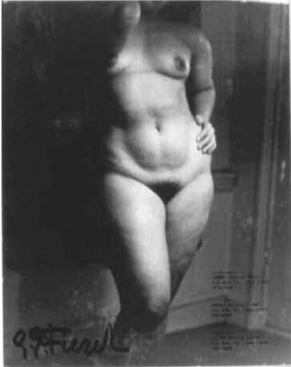
ABOVE UNTITLED , ca. 1960s 19 5 / 8 x 15 3 / 4 in. (49.8 x 40 cm) on mount 23 3 / 4 x 19 in. (60.3 x 48.3 cm)