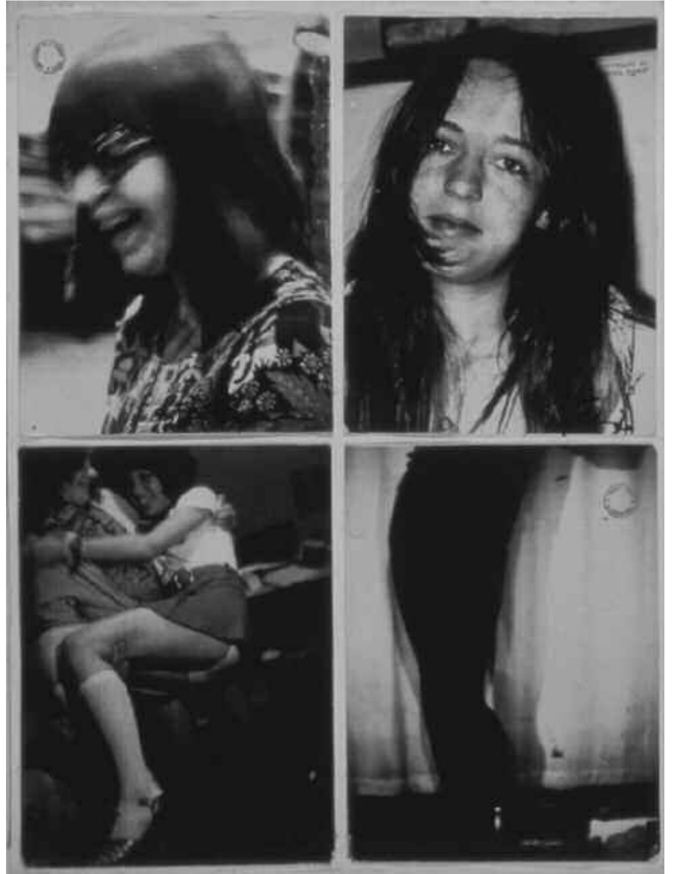
OPPOSITE UNTITLED , ca. 1960s composite of four photographs, each 9¾ x 7 in. (23.8 x 17.8 cm) on mount 19 x 14¾ in. (48.3 x 36.5 cm)