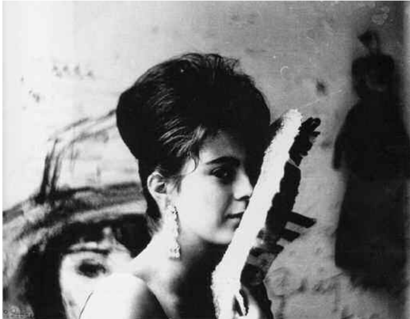
UNTITLED , ca. 1960s 18¾ x 23½ in. (47.6 x 59.7 cm) flush-mounted on board

G erard Petrus Fieret's photographs are unforgettable. The fresh, innovative portraits and alluring nudes of the 1960s and 1970s, their prints liberally anointed with his copyright stamps and signed in a celebratory flourish of penmanship, are widely and increasingly appreciated.