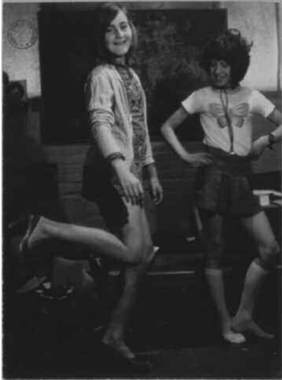
LEFT UNTITLED , ca. 1960s 9½ x 7 in. (24.1 x 17.8 cm)