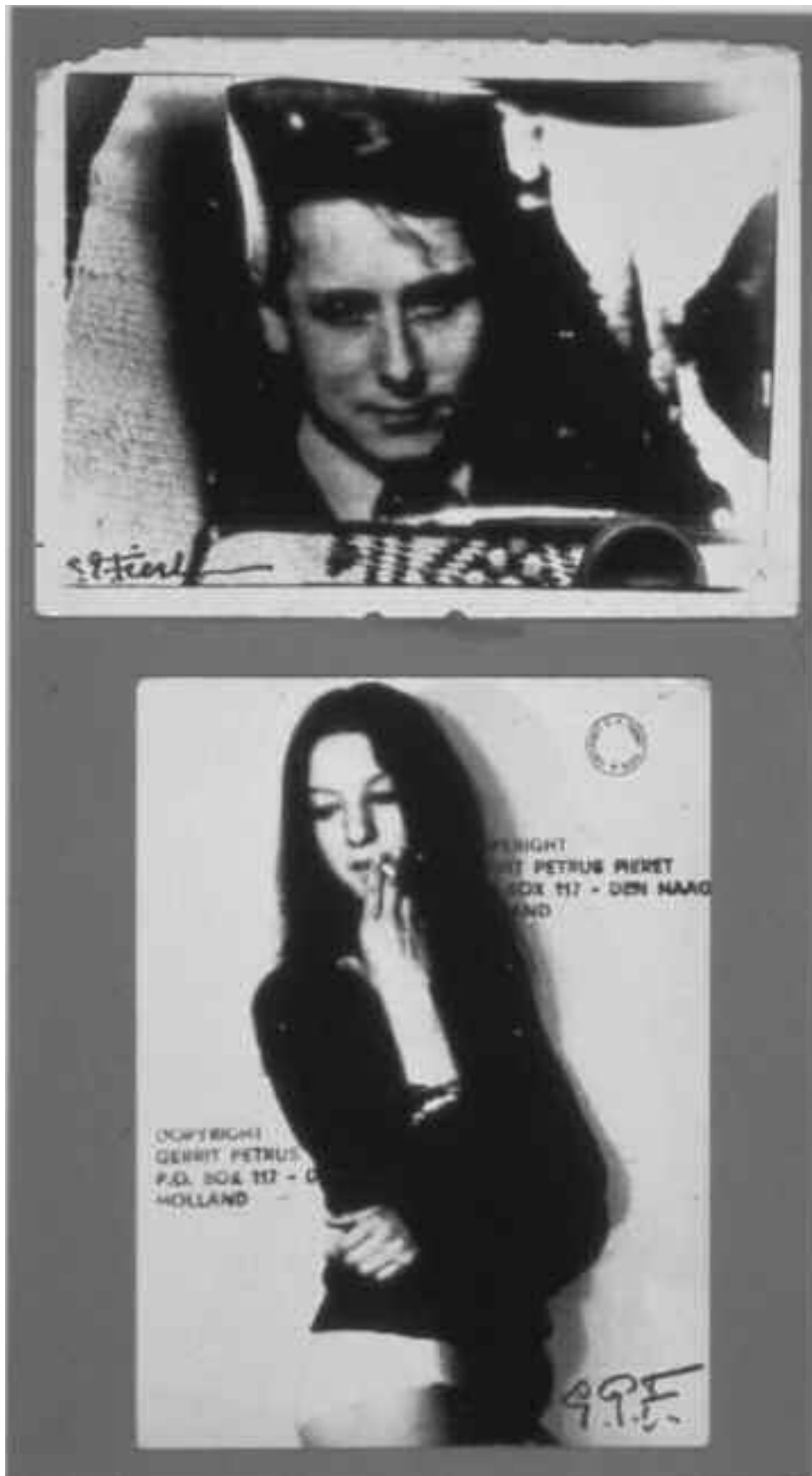
UNTITLED , ca. 1960s composite of two photographs, including one self-portrait, top 7 x 9 \frac{3}{8} in. (17.8 x 23.8 cm); bottom 9 \frac{3}{8} x 7 in. (23.8 x 17.8 cm) on mount 20 x 14 \frac{1}{8} in. (50.8 x 35.9 cm)