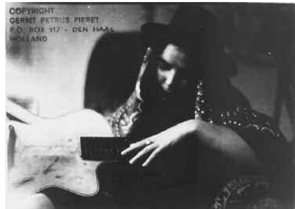
TOP UNTITLED , ca. 1960s 6¼ x 8¾ in. (15.9 x 21.9 cm)