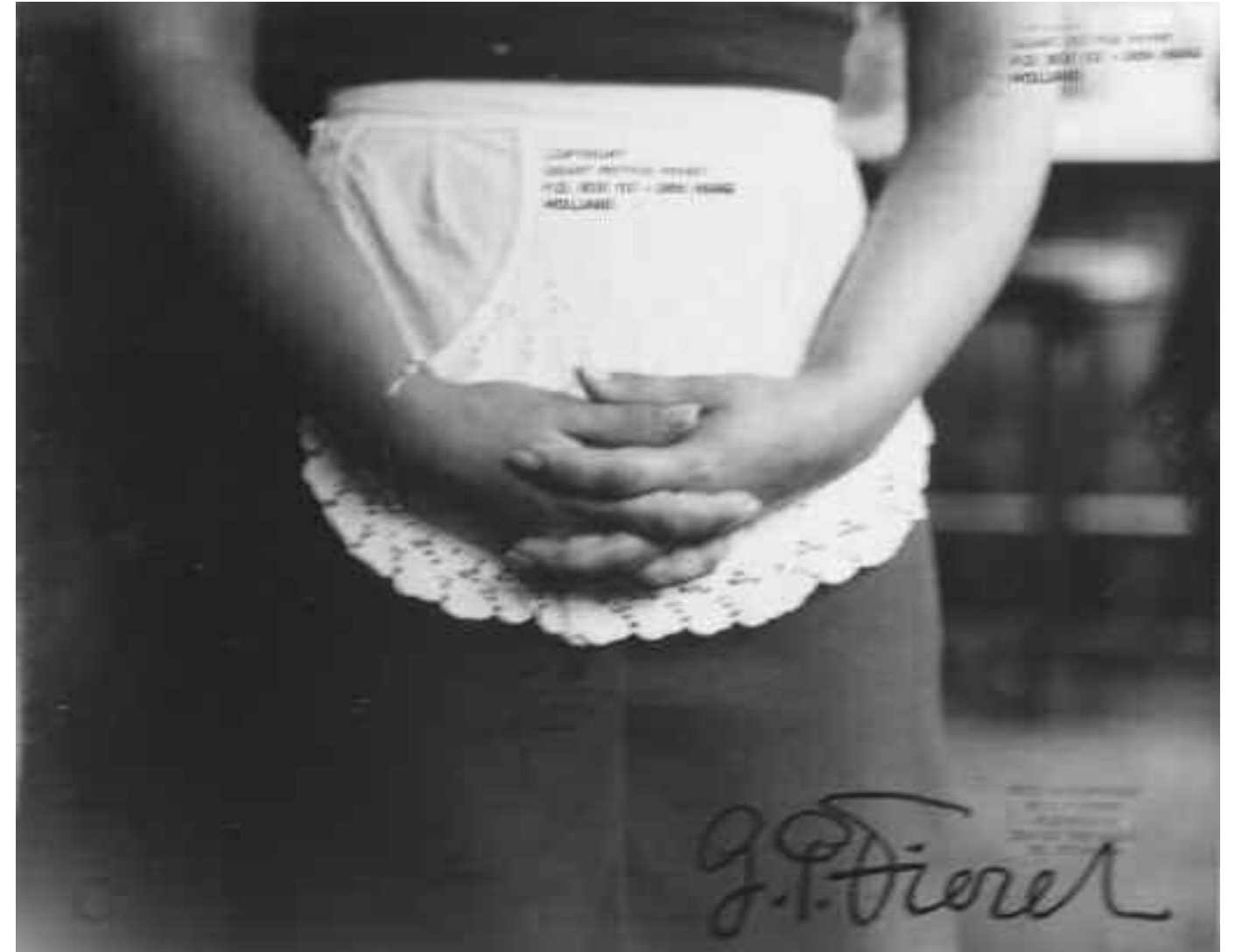
UNTITLED , ca. 1960s 15 5/8 x 19 1/2 in. (39.7 x 49.5 cm)