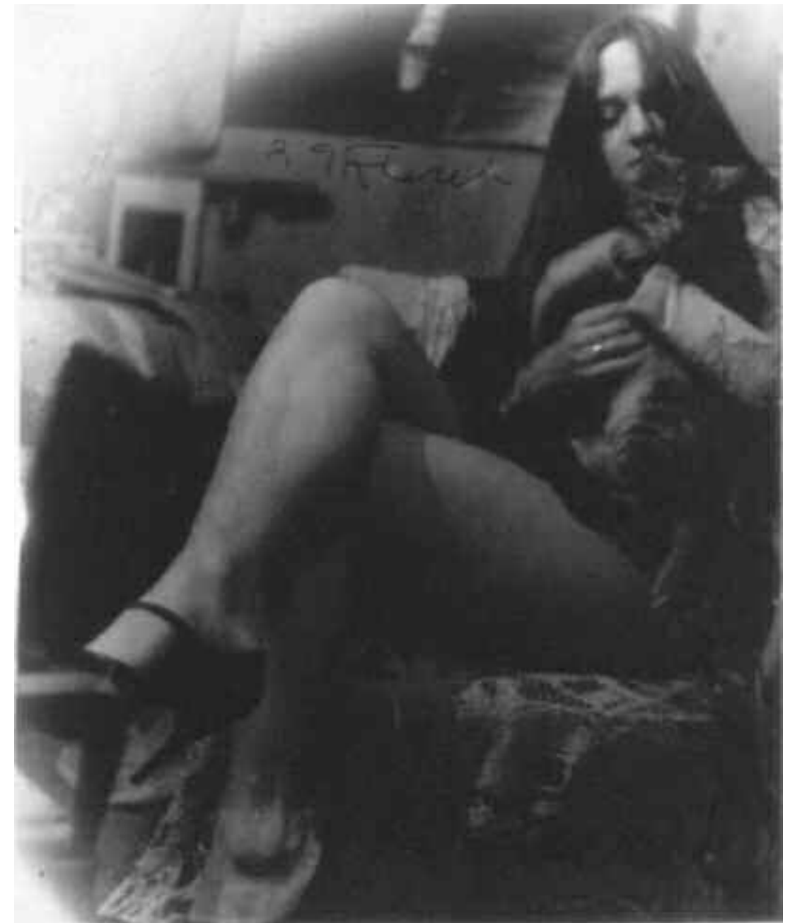
ABOVE UNTITLED , ca. 1960s 19 5 / 8 x 15 3 / 4 in. (49.8 x 40 cm) on mount 33 5 / 8 x 19 in. (85.4 x 48.3 cm)