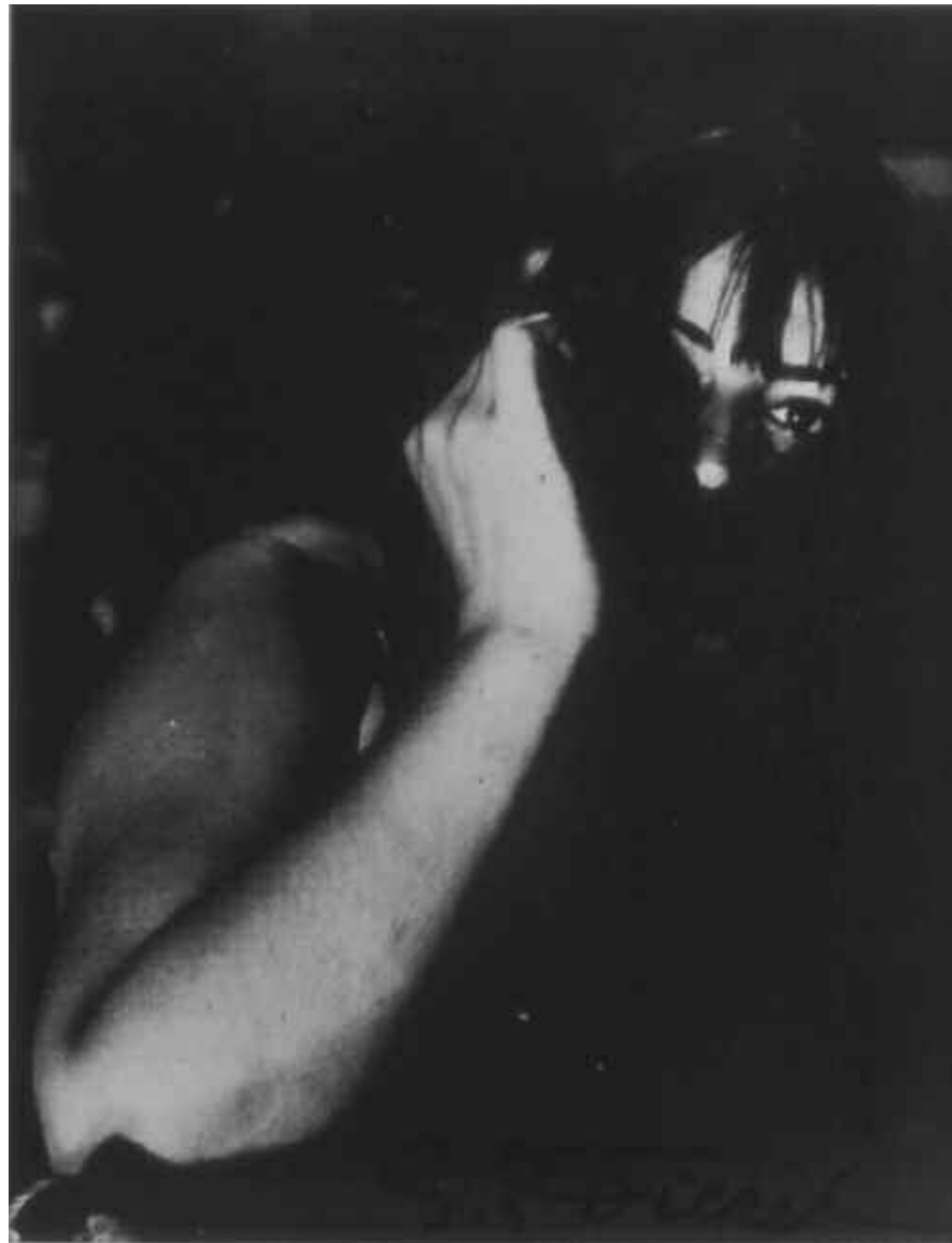
ABOVE UNTITLED , ca. 1960s 19½ x 15½ in. (49.5 x 39.4 cm)