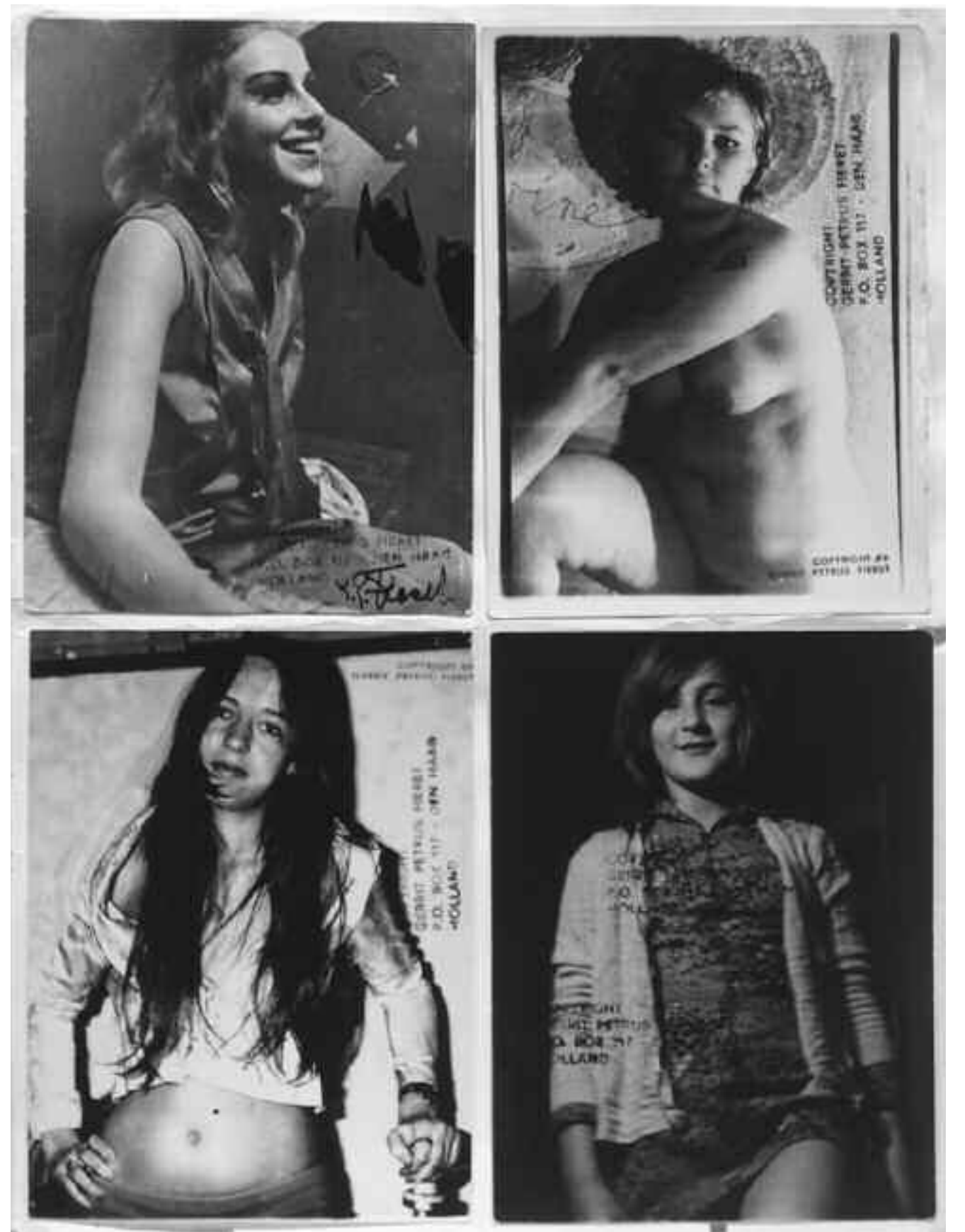
OPPOSITE UNTITLED , ca. 1960s composite of four photographs, each 9 3/8 x 7 in. (23.8 x 17.8 cm) on mount 19 1/2 x 15 1/4 in. (49.5 x 40 cm)