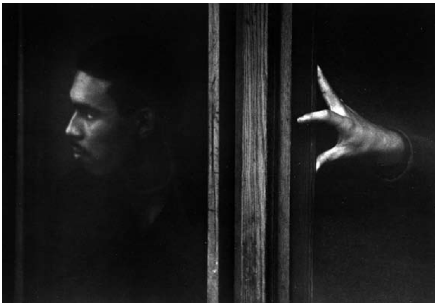
Staten Island Ferry, 1967